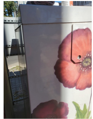
After Ambassadors' efforts