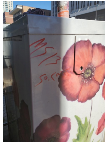
Before: graffiti on Art Walk transformer box