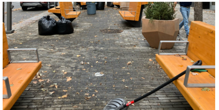
After Ambassadors' efforts