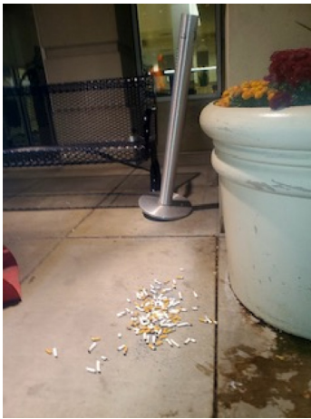
Before: cigarettes on sidewalk

Our Ambassadors take great pride in the impact they have in downtown. Below are before and after photos with visual examples of their impact.