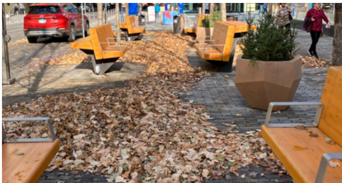
Before: fall leaf removal on 1st Avenue SW