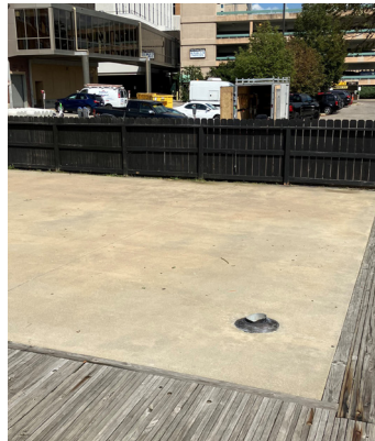
After Ambassadors' efforts