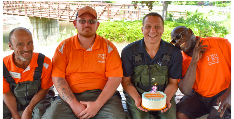
The Clean and Safe Ambassadors celebrated its second full year of operation July 1, 2022.