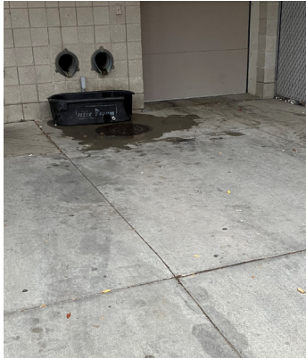
After Ambassadors' efforts