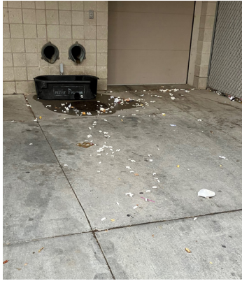
Before: debris in 3rd St. alley

Our Ambassadors take great pride in the impact they have in downtown. Below are before and after photos with visual examples of their impact.