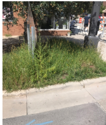
Before: unmown lot