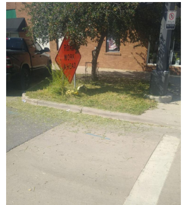
After Ambassadors' efforts