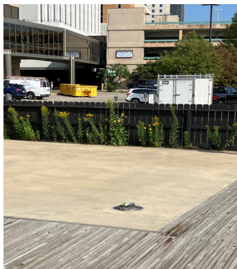
Before: weeding at The Deck