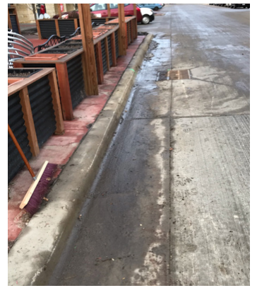
Before: cluttered city gutter After