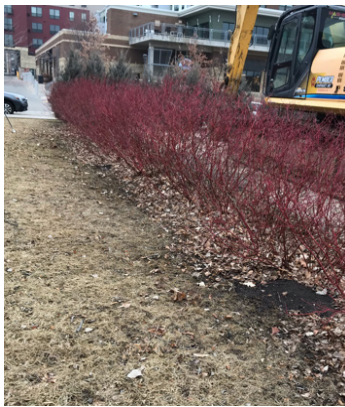
Before: leaf debris in city bushes After