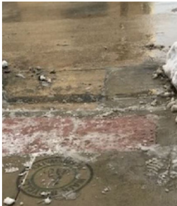
Before: ADA sidewalk curb ramp After